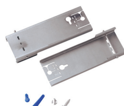
Wire suspension kit 4338607.