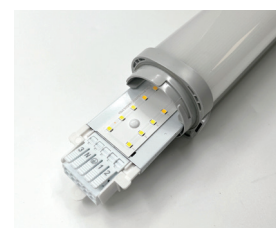
InduProof can be easily repaired if necessary.