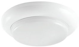
A white decorative frame is available as an accessory.